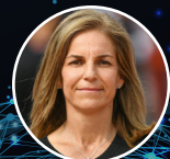
Arantxa Sánchez Vicario

Don't miss 14x Grand Slam champion Arantxa Sánchez Vicario as she discusses mental toughness and the keys for success. The session will be led by her brother, former World No. 1 in doubles, Emilio Sánchez Vicario.