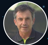
Emilio Sánchez Vicario

Former Spain Davis Cup captain Emilio Sanchez Vicario showcases some of his favorite drills working on improving the contact point for more controlled and effective shots. Use these progressions to help your players improve the point of contact, ball placement as well as movement & footwork. Get ready for a session filled with lots of movement and fun!